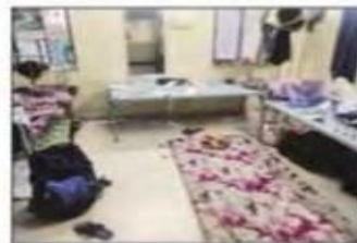
Lodged in cramped hostels, each resident doctor is sharing a room with three or four other doctors.

Doctors are now requesting separate accommodation for those posted in fever clinics and