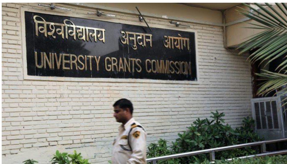
UGC building in New Delhi

New Delhi: The University Grants Commission (UGC) has sought to justify its decision of making final-year exams mandatory for college and university students by citing top-ranking global institutes such as MIT and Cambridge University which conducted exams during the Covid pandemic.