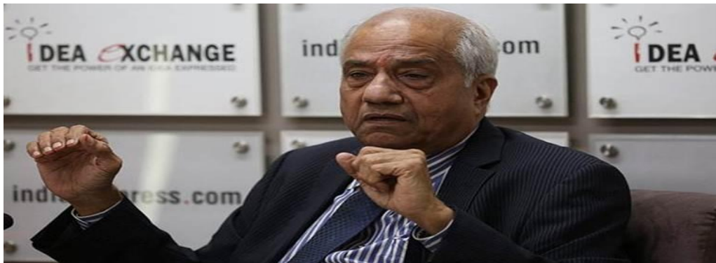
Former Supreme Court Judge Justice B N Srikrishna at Idea Exchange

Written by Apurva Vishwanath | New Delhi | Updated: May 13, 2020 11:37:10 am